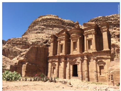
... and have a safe flight home Thank you shukrun